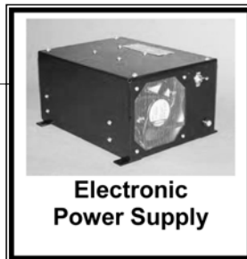
Electronic Power Supply